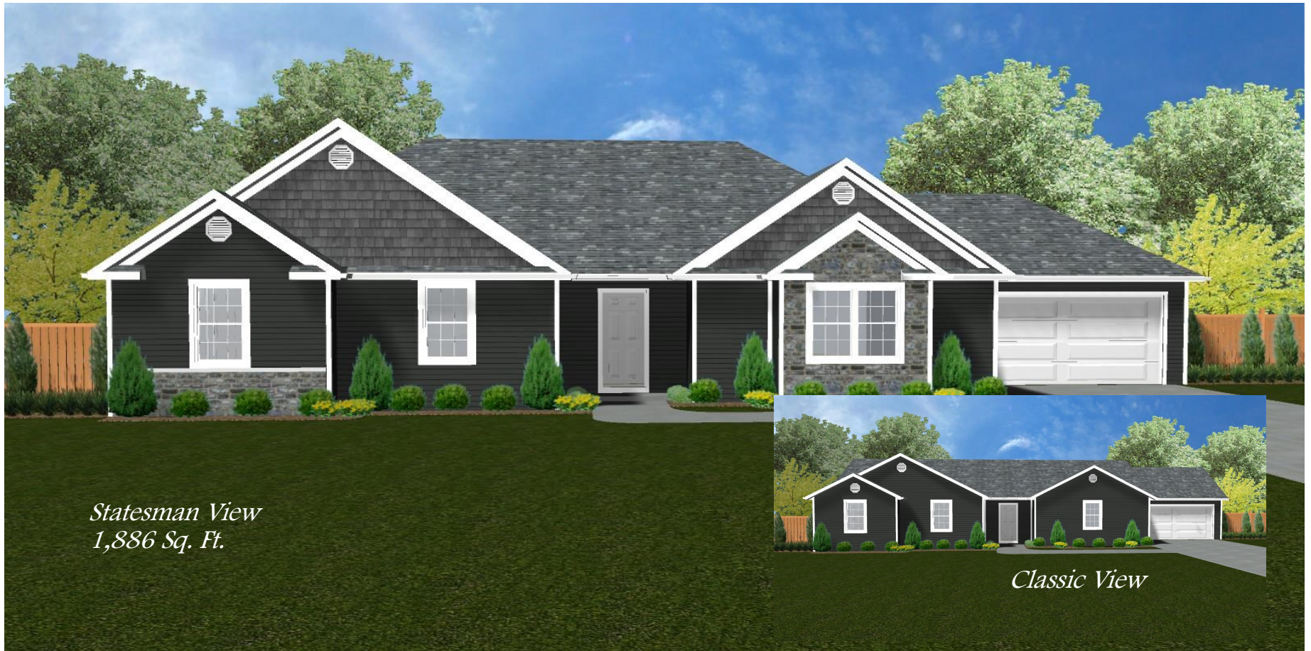
Statesman View 1,886 Sq. Ft.