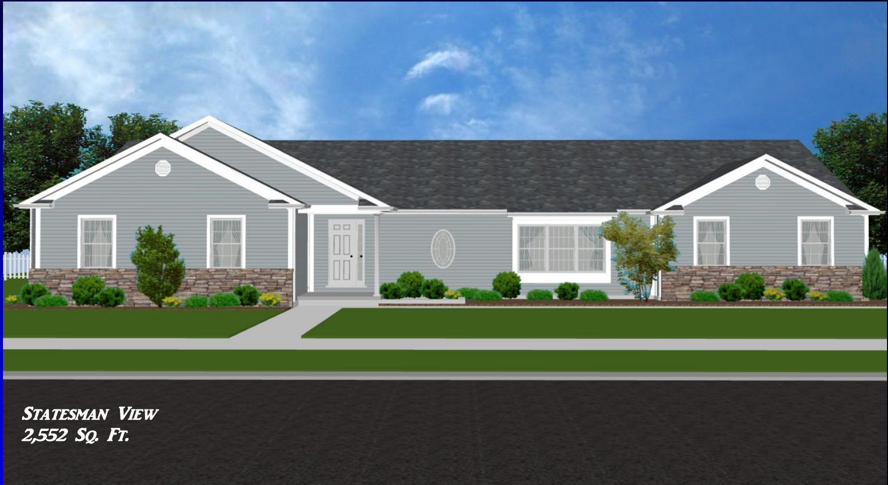
STATESMAN VIEW 2,552 SQ. FT.