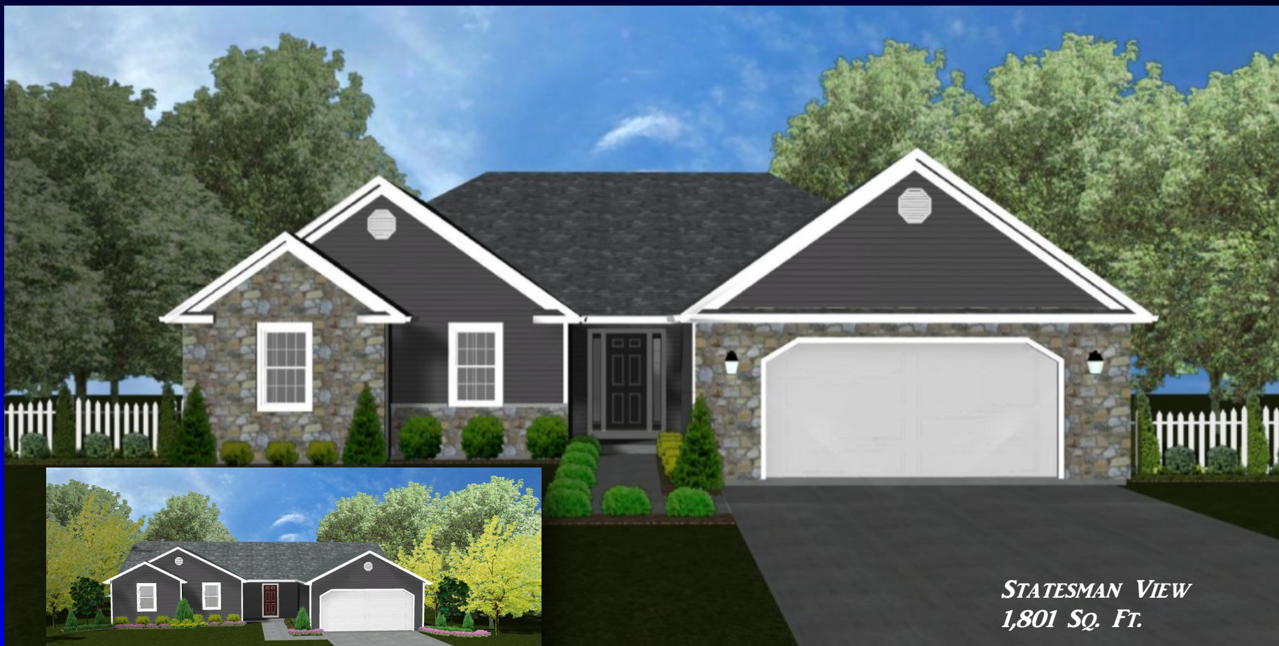
STATESMAN VIEW 1,801 SQ. FT.