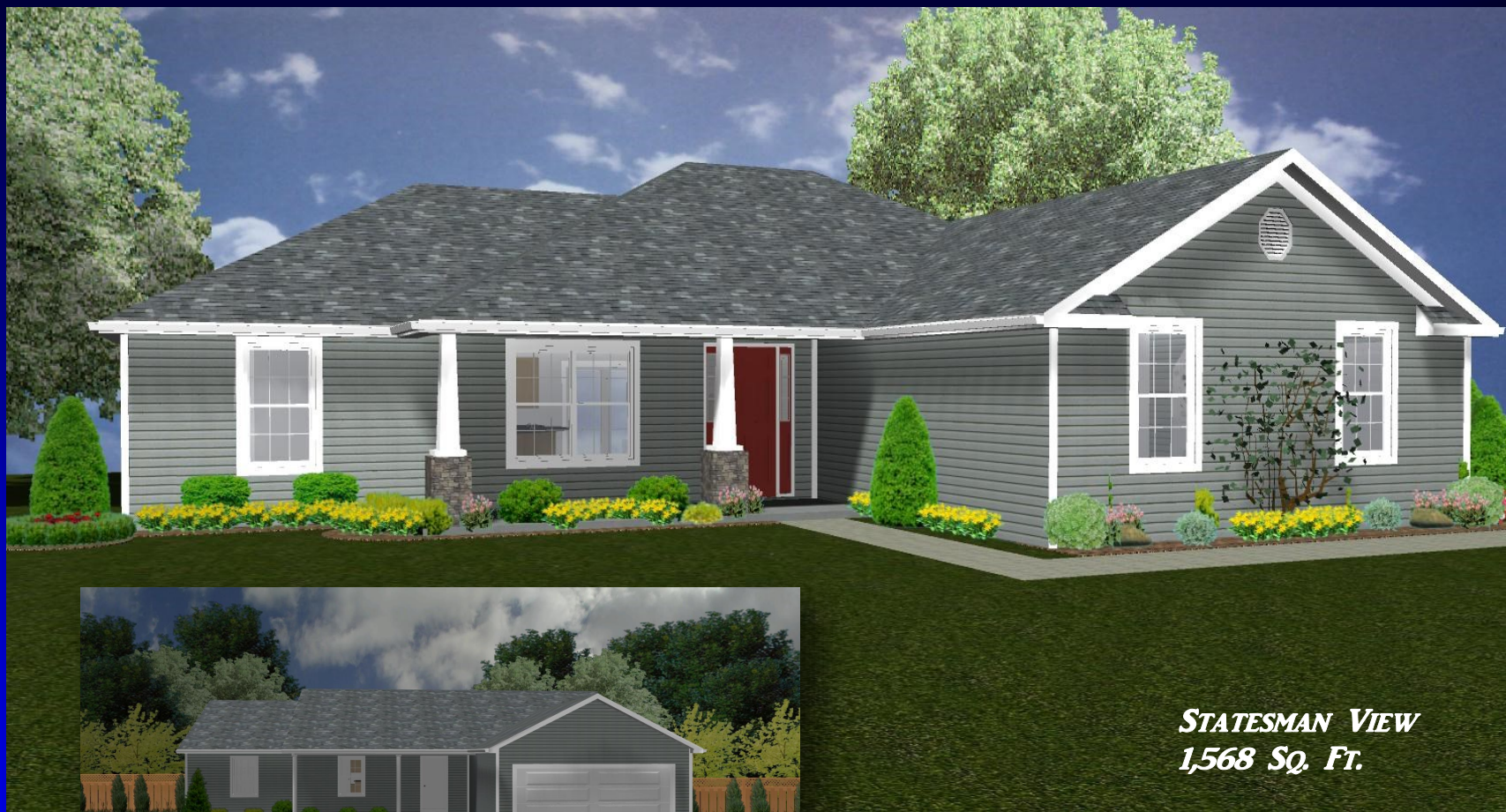
STATESMAN VIEW 1,568 SQ. FT.