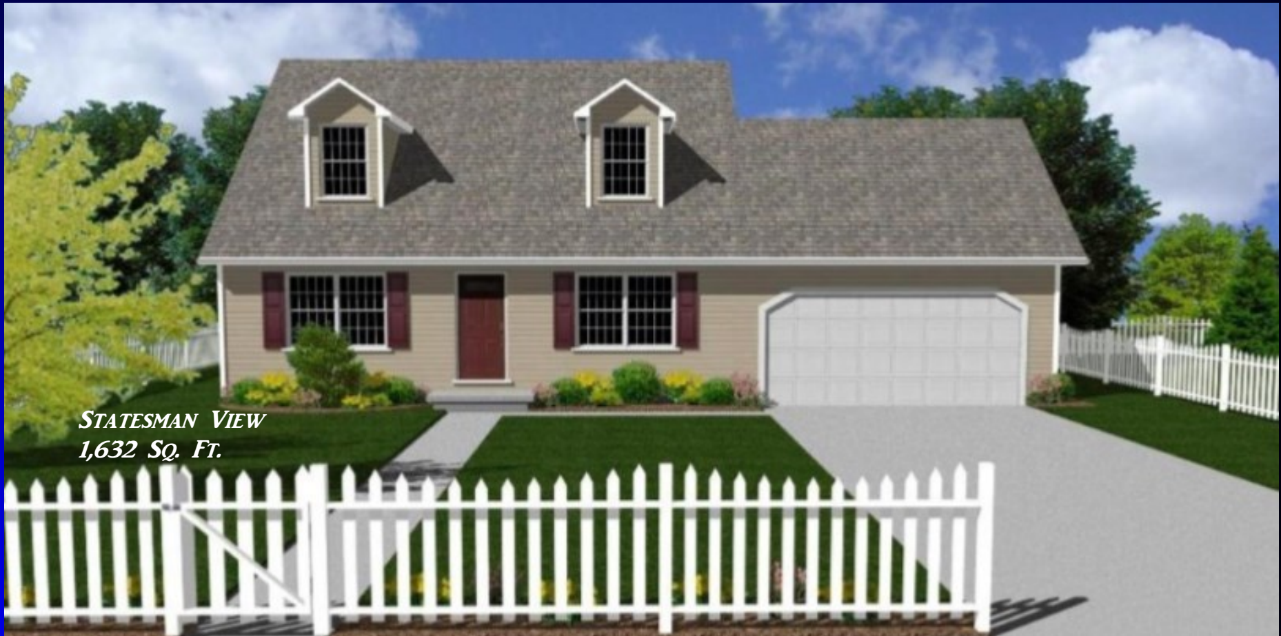
STATESMAN VIEW 1,632 SQ. FT.