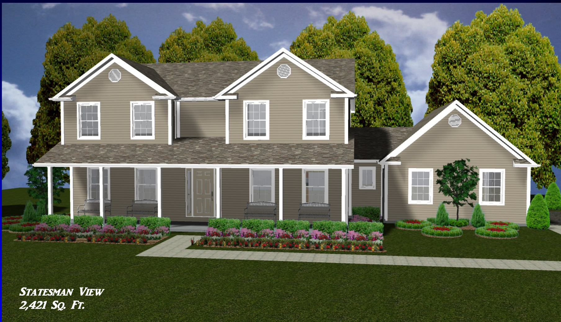
STATESMAN VIEW 2,421 Sq. Ft.