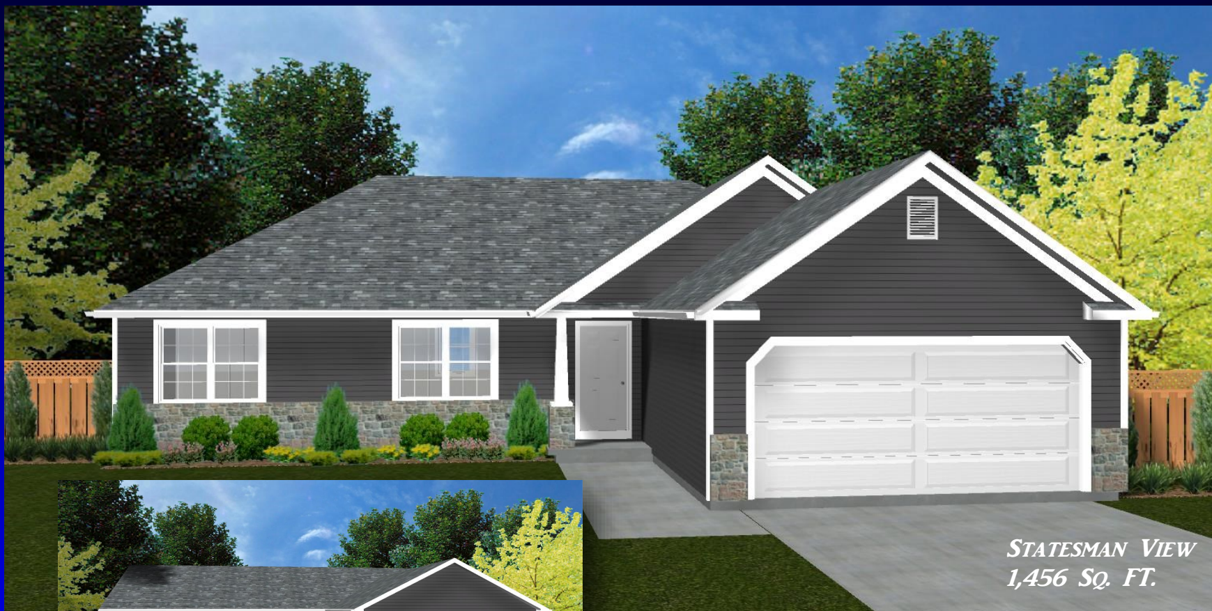
STATESMAN VIEW 1,456 SQ. FT.