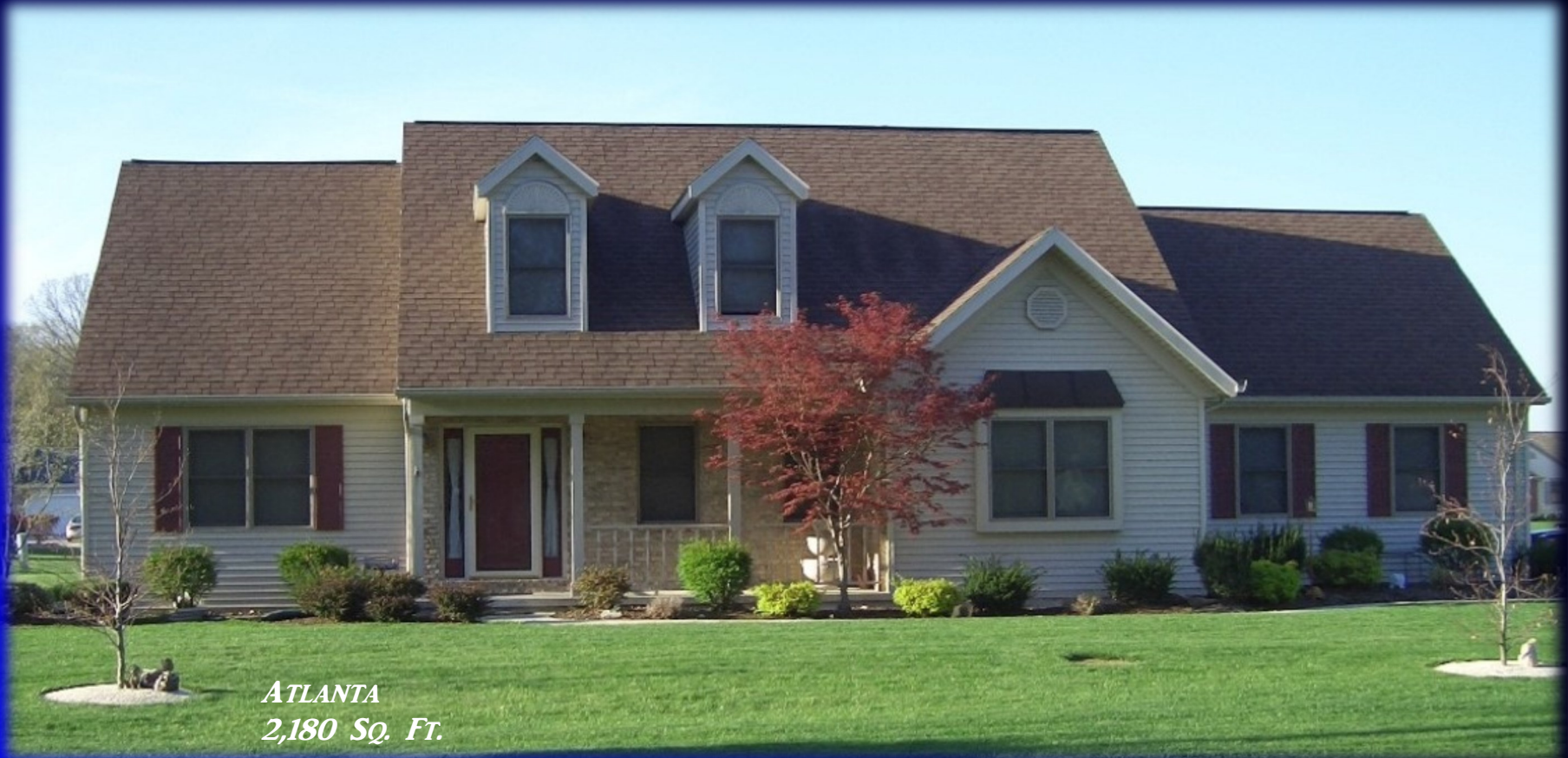
ATLANTA 2,180 SQ. FT.