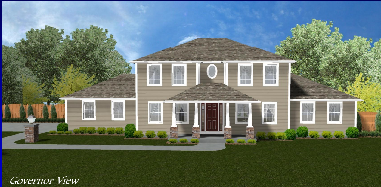
Governor View 2,252 Sq. Ft.